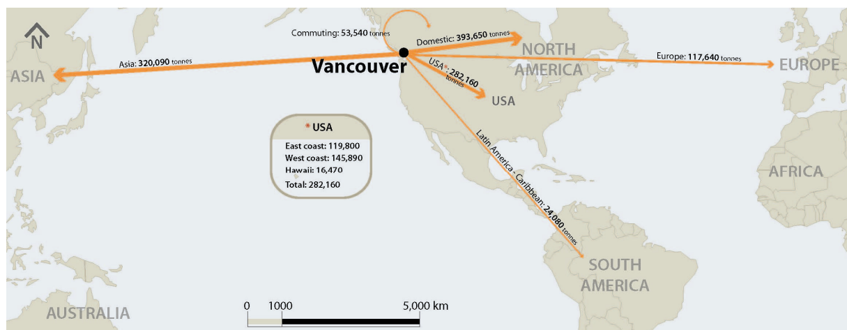
Figure 1a. Metro Vancouver air travel GHG emissions by destination, Approach "A"

Figure 1 (a and b) breaks down Metro Vancouver air travel GHG emissions by specific destinations for both calculation procedures and shows there are considerable differences between them. For example, according to YVR data (Approach A) approximately 43% of GHG emissions were associated with flights to Asia. The Statistics Canada survey data produced a corresponding number of only 21%. Similarly Approach A suggests that flights to Europe account of 15% of GHG emissions while Approach B associates 23% of GHG emissions to European destinations.