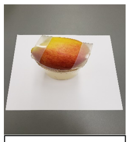
A plastic film was used on apples to keep the surface

The apples were brought to the lab at BCIT where the Luminometer and ATP test swabs were kept. The SystemSURE Plus <sup>™</sup>