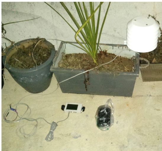
Figure 1: Photo of the sampling location set-up. Clockwise from top right: Met One 064-2 sensor with solar shield, Samsung Galaxy S4 phone in plastic bag, Met One data logger.

suburban location. The location was protected from both sun and wind with an overhang and a concrete wall [Figure 1]. This was done in order to minimize error due to wind chill and solar radiation. The Samsung Galaxy S4 was placed in a thin plastic produce bag in order to protect it from damage and dirt. Then, both the Samsung Galaxy S4 and the Met One 064-2 were placed on a flat surface next to each other at a maximum of two feet apart. Once the equipment was placed at the location, the sensors were given enough time for the temperature readings to stabilize before recording the values. This was done in order to increase the accuracy of the readings. Moreover, the manufacturer of the SHTC1 IC recommends it in their app upon start-up (Sensirion AG, 2014). A total of 31 readings – measured on average 11 minutes apart – were taken at that location over the course of 4 days.