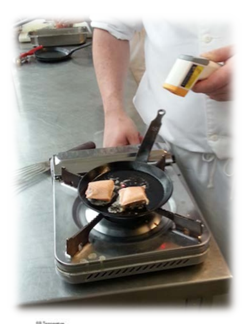
Figure 2: Searing step setup with searing pan, gas stove, salmon, and infrared thermometer

the experiment, SmartButtons were connected to the computer via USB interface cable for data retrieval.