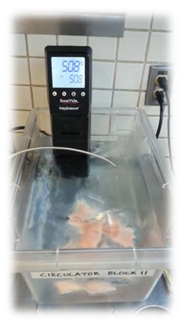
Figure 1: Immersion circulator with vacuum packaged salmon in circulating water bath

Fish Preparation. Large packages of whole salmon were taken out of the cooler, deskinned, cut into portion sizes, scaled, placed in plastic bags and put into an ice bath until used. A small incision (approximately <sup>1</sup>/<sub>2</sub> inch) was made on each salmon portion and SmartButton was inserted into the thickest part of the fish. Time of insertion was recorded in the notebook.