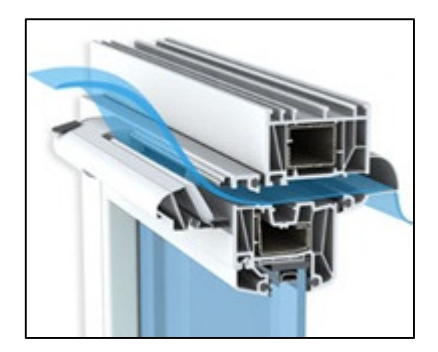
Figure 1. A Trickle Ventilator

ventilation was better at reducing carbon dioxide while also allowing for the best thermal comfort and energy savings (Griffiths & Eftekhari, 2007). When the classroom was naturally ventilated, it was found that though this method reached the lowest maximum carbon dioxide concentration of 1770 ppm, it caused significant thermal discomfort to students (Griffiths & Eftekhari, 2007). When classrooms were purged with fresh air for 10 minutes twice in timed intervals during the school day, it was found that though it was effective in reducing carbon dioxide concentrations by approximately 1000 ppm, it also caused a 3°C decrease in ambient room temperature (Griffiths & Eftekhari, 2007). Additionally, purging the room with fresh air only appeared to be a temporary solution as concentrations of carbon dioxide quickly rose thereafter (Griffiths & Eftekhari, 2007). In order to set a control for this study, ventilation modes for this classroom were then left alone by the researchers and instead left to the control of the occupants. When this was done, it was found that carbon dioxide concentrations fluctuated wildly with lower minimum concentrations but had relatively similar maximums as other methods (Griffiths & Eftekhari, 2007). In figure 1 below is a picture of a trickle ventilator.