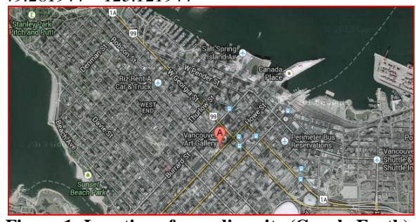
Figure 1: Location of sampling site (Google Earth)

800 Robson Street, Vancouver, BC, V6Z 2E7 49° 16' 55'' N, 123° 7' 19'' W 49.281944 – 123.121944