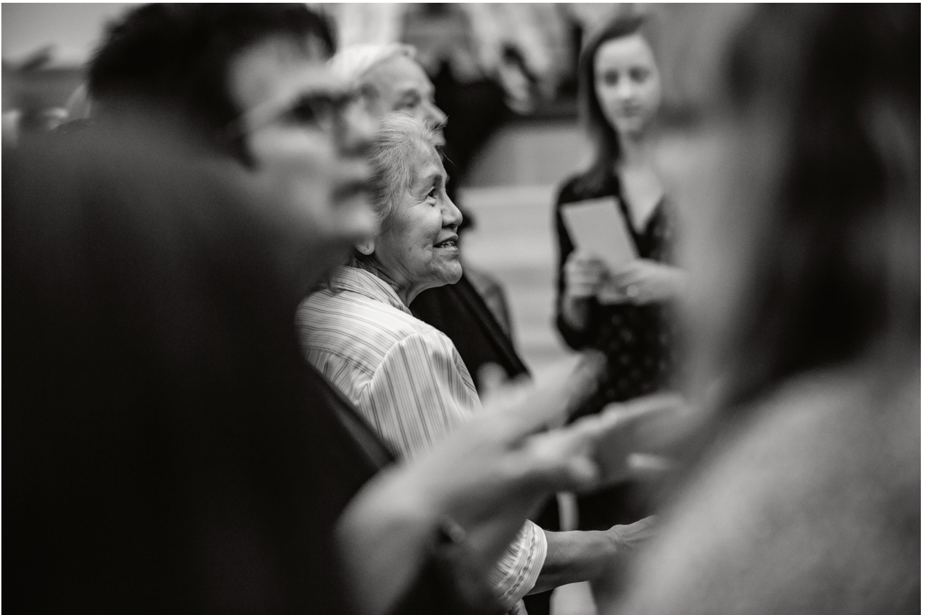
Fig 2.1: Indigenous graduate reception.