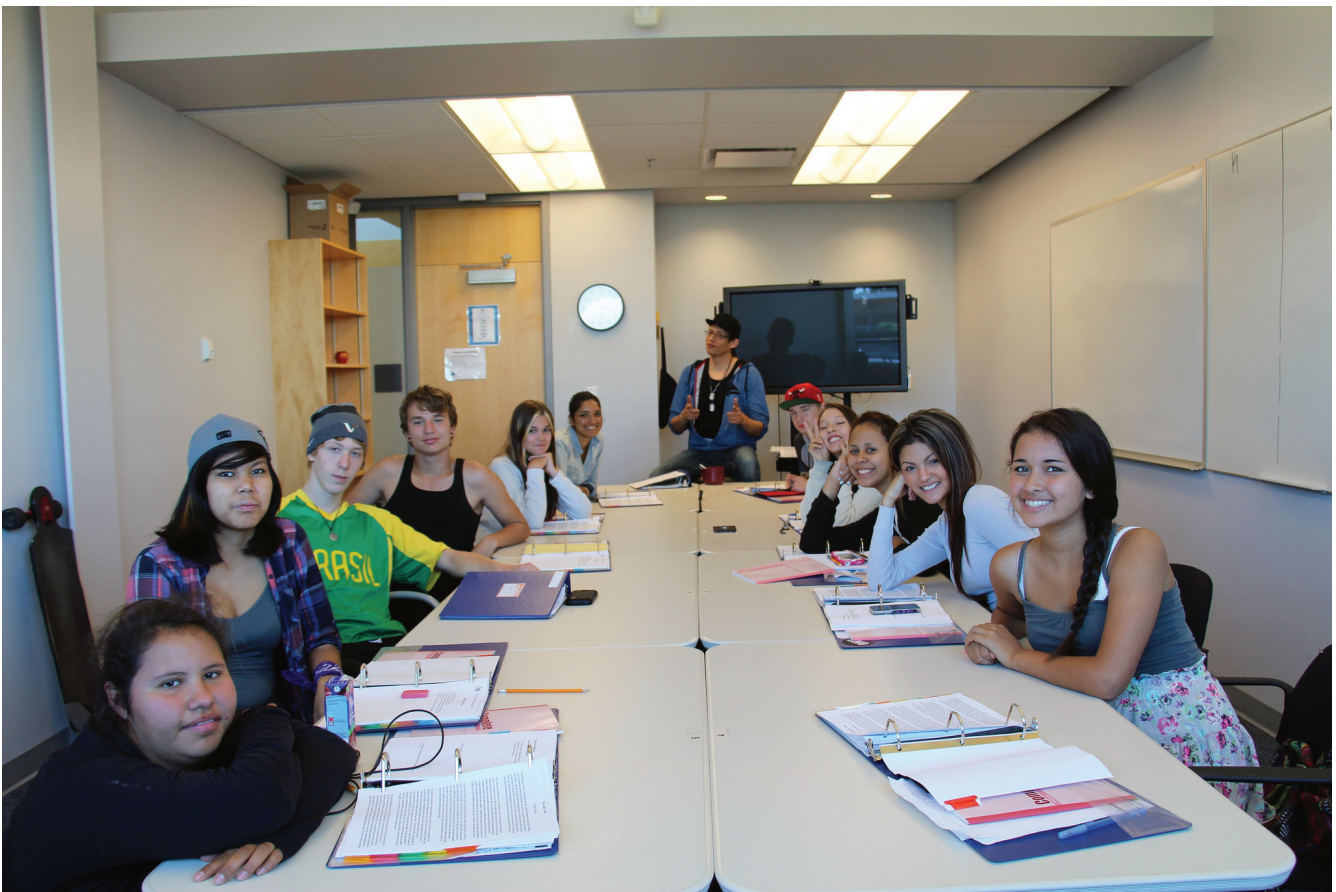
Fig 1.1: Aboriginal math/English camp.