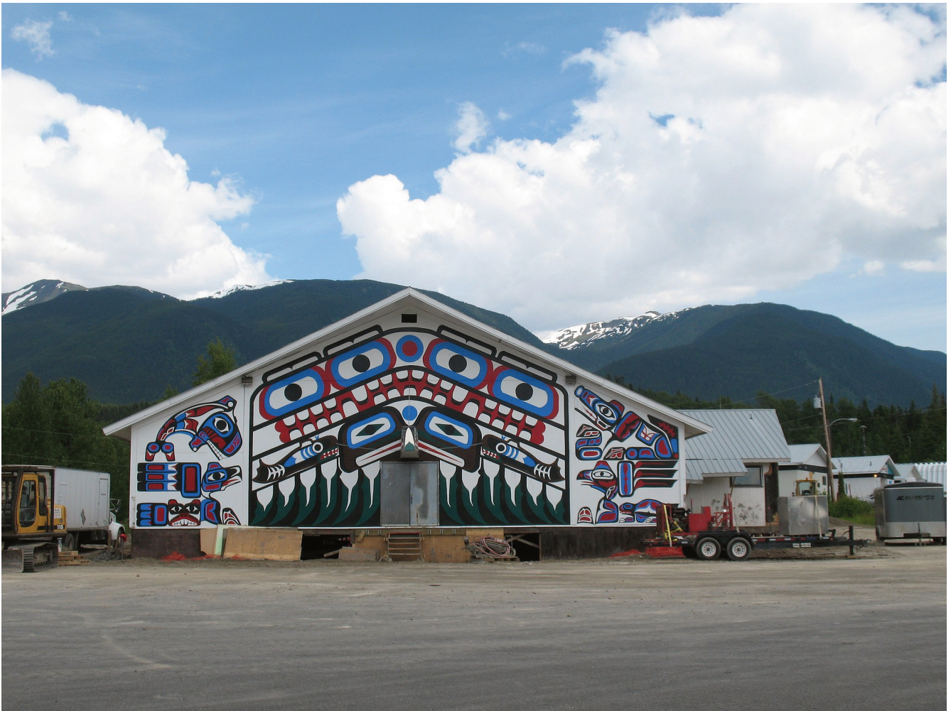
Fig 4.1: Traditional Nisga'a house in New Ayanish.