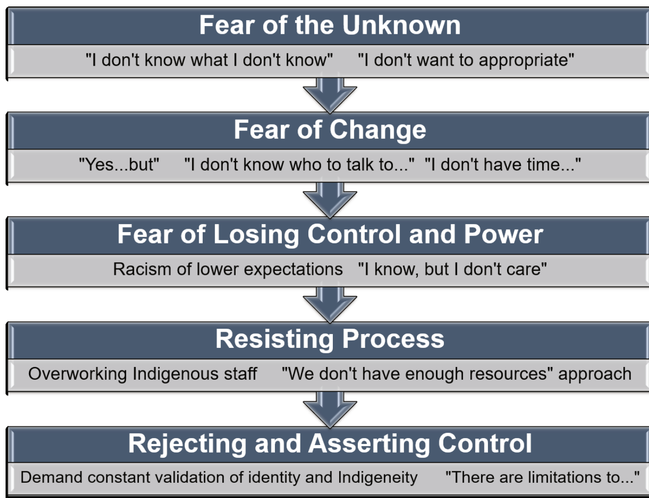
Fig 4.2: Levels of Indigenization. [Long Description]

Here are some strategies to keep in mind to help you overcome these challenges and barriers: