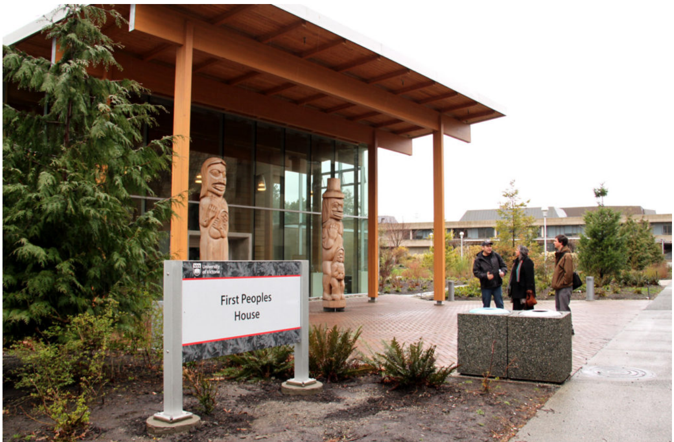
Fig 1.1: First Peoples House, University of Victoria.