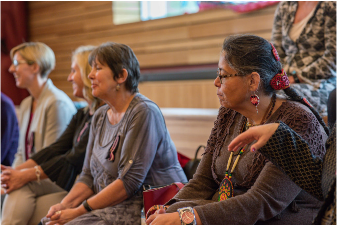
Fig 4.1: UFV – Metis Nation-BC Joint Project Announcement.