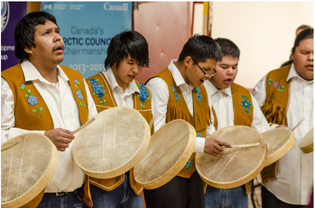
Fig 2.1: The Tlicho Drummers and the Yellowknives Dene First Nation Drummers.