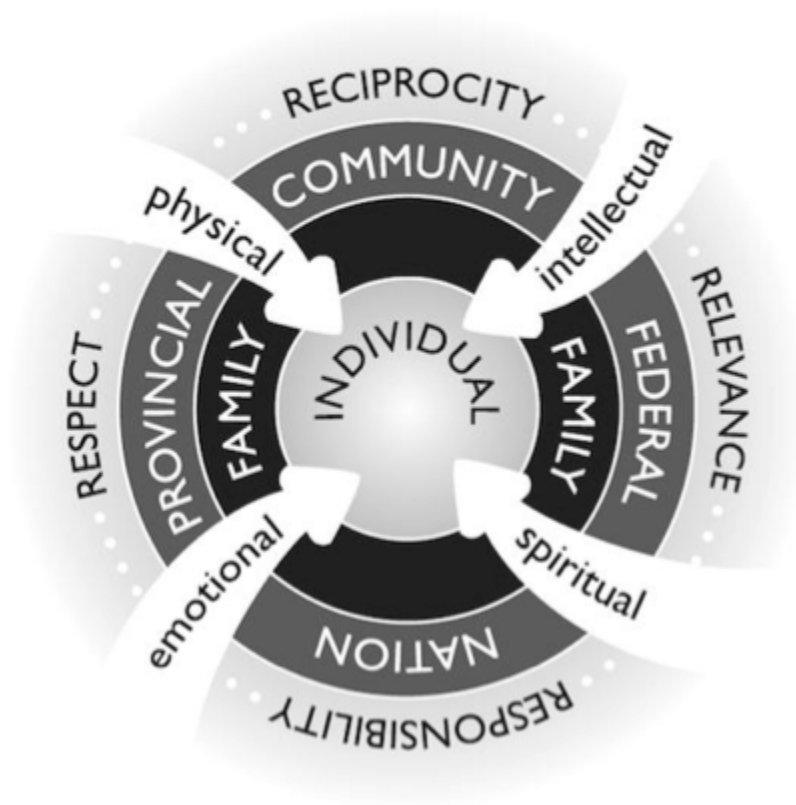
Fig 2.2: Indigenous wholistic framework.

This Indigenous wholistic framework provides guiding principles to ensure post-secondary institutions become accessible, inclusive, safe, and successful places for Indigenous students as follows: