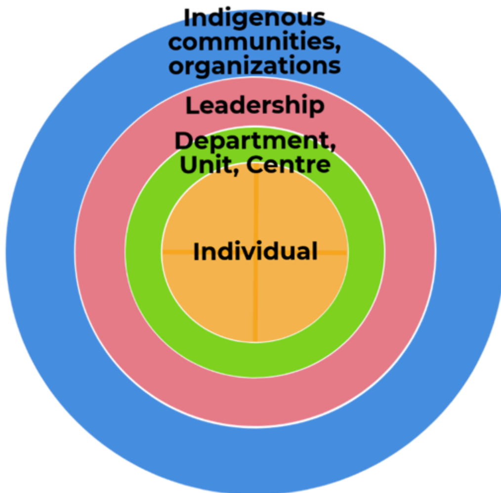
Fig 2.2: Institutional interconnections to Indigenization.

Indigenization in practice is deeply grounded in the traditions and cultural protocols of the traditional landholders that an institution is built upon; it is informed by the diversity of First Nations, Métis, and Inuit of Canada.