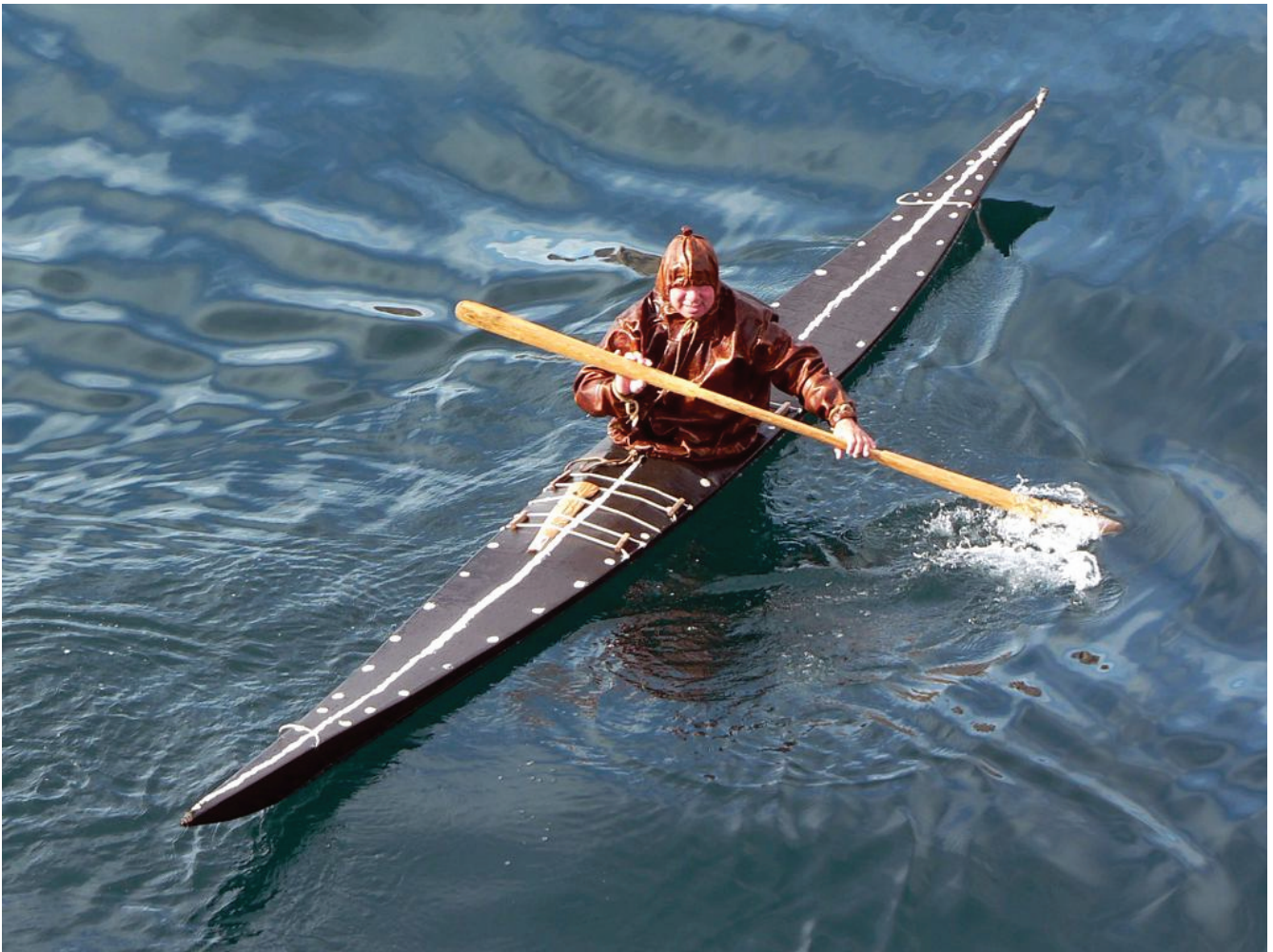
Fig 4.1: Inuit Kayaker