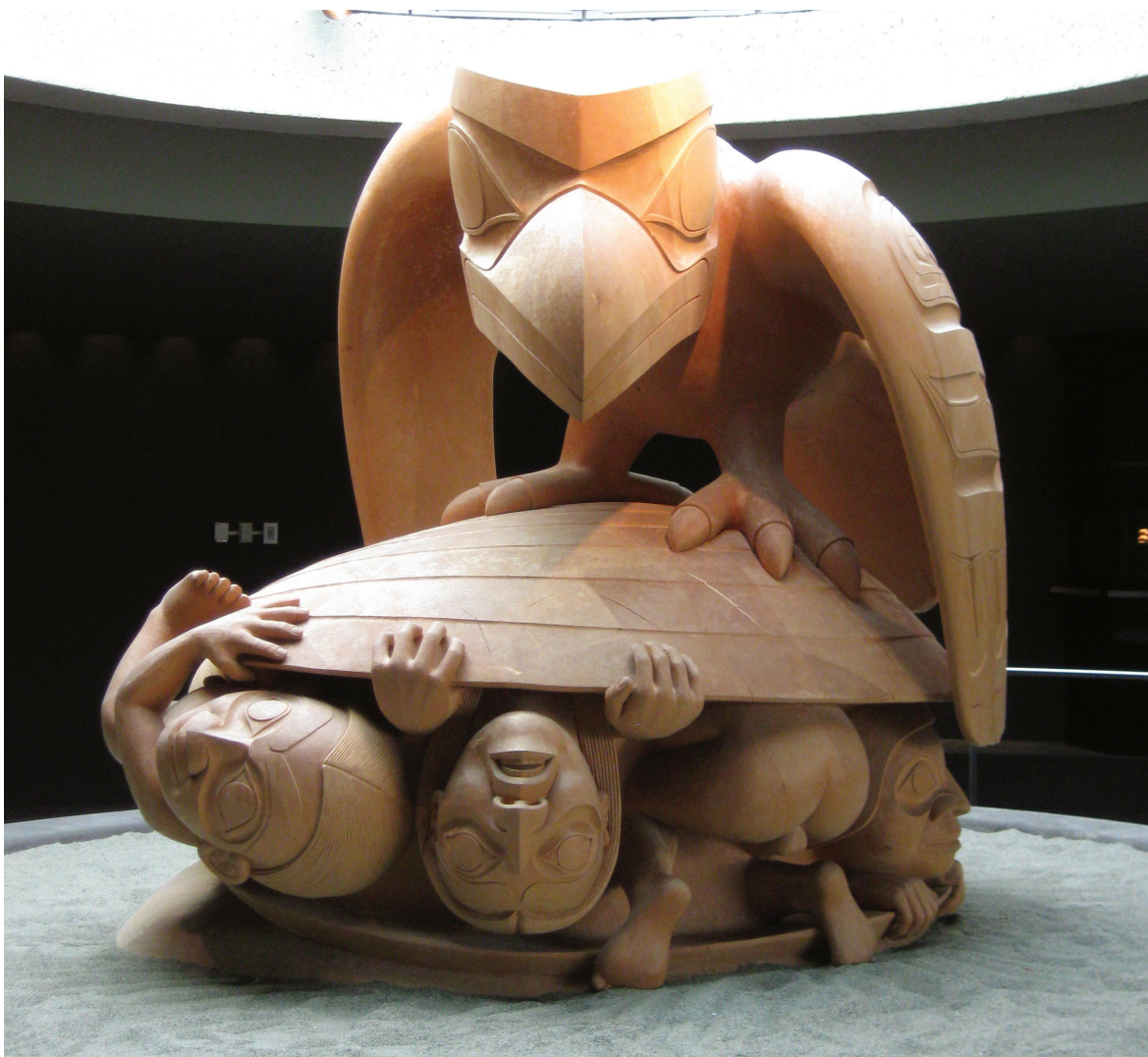
Fig 1.1 "Raven and the First Men" by Bill Reid , Museum of Anthropology, UBC, Vancouver, British Columbia