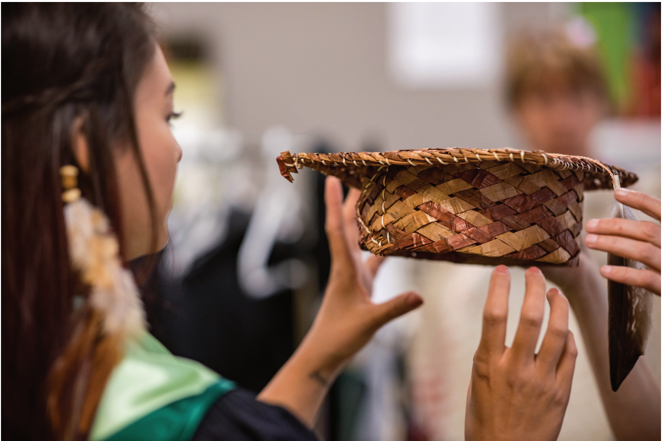
Fig 5.1: UFV Indigenous Graduate Reception 2017