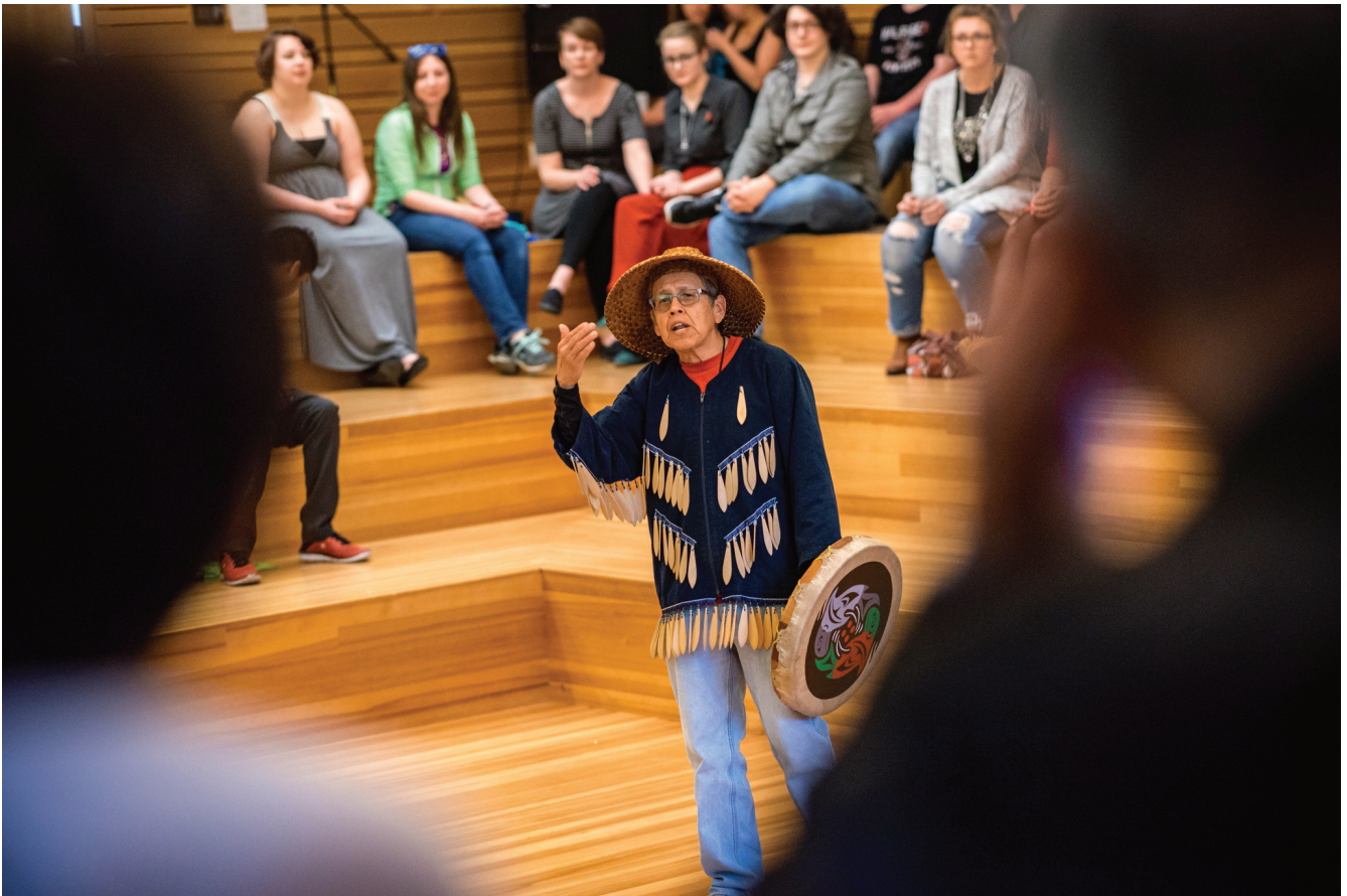
Fig 3.1: Indigenous Graduate Reception